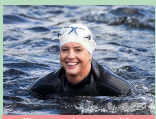
"They saved my son's life. Without their intervention, he would not be with us today."